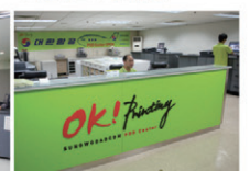
OK! Printing 3호점