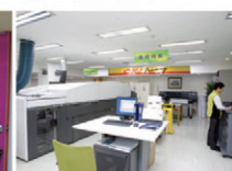
OK! Printing 2호점